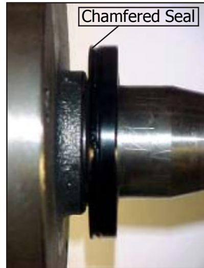
fig. a - Correct Seal Orientation

It is important when replacing the new labyrinth type bearing seals in X-Press disc hubs that the seal is fitted the right way round. The chamfered lip side should be at the outside of the bearing housing (see fig. a ). This chamfered lip prevents dirt ingress into the housing and also allows grease to be flushed through when greasing.