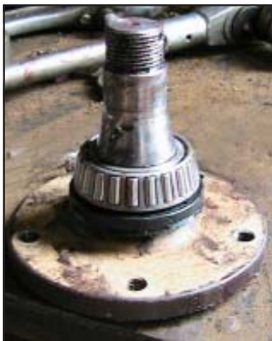
fig. b - Spindle w/Bearing & Seal

Also, Simba recommend that the seal and outermost bearing are assembled on the spindle (as per fig. b ) before inserting it into the housing and reassembling the unit ( fig. c ).