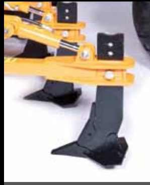
HYDRAULIC RESET SUBSOILER TINES