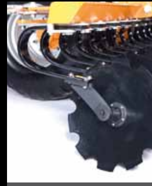
PRO-ACTIVE DISC UNIT